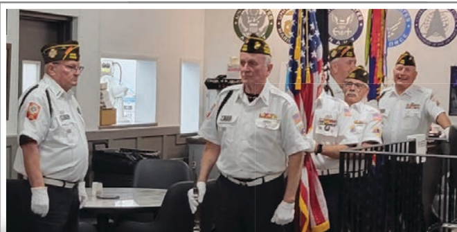
POW/MIA Ceremony & Banquet With our Post Honor Guard & Commander Presentation