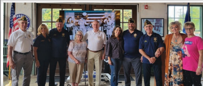
Old Settlers Post Members and Auxiliary at Rosie the Riveter Ceremony at the Packard Proving Grounds