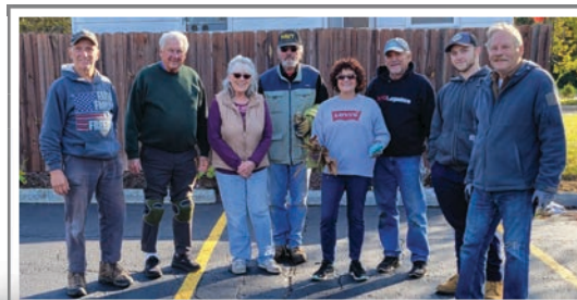
Post & Auxiliary Fall Planting Crew