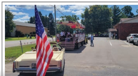
Romeo Peach Festival Parade Line Up On Labor Day 2024